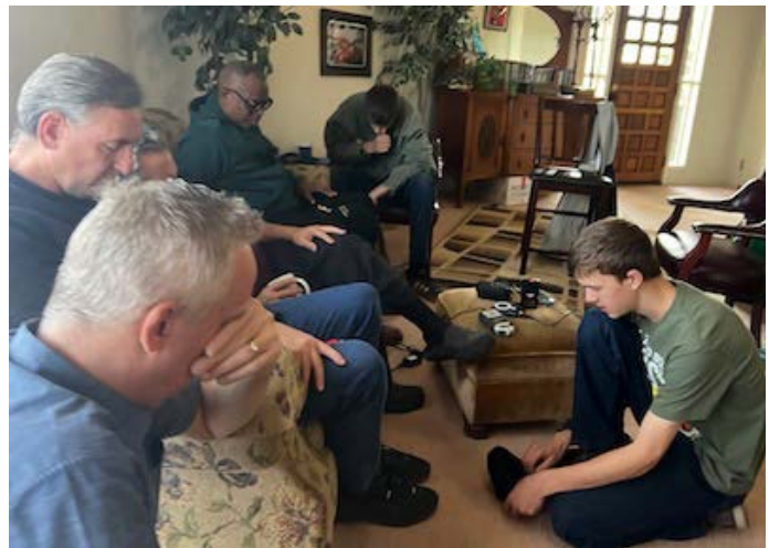
Praying During the Training

While getting a tea at the store, the opportunity to do an STS Bible story arose. In spite of her fear and perfectionism, our sister witnessed to someone for the first time and she did it with a Bible story,